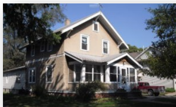
Emergency Residence Project (ERP)

The STC Individual Assistance is one of the 10 groups receiving monthly payments. Their annual expenses were $14,527. Receipts were $4,800 transferred to them from the Black Bag funds plus $9,645 in donations made directly to them from other sources.