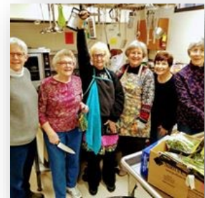
Food At First—St. Cecilia volunteers provide meals every Tuesday of the month

Volume 9 Issue 3 August 2019 Editor: Lynn Franco Page 1