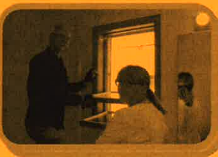
Open House/Dedication— May 10, 2015