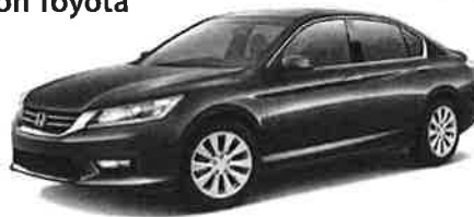
2014 Honda Accord Lithia of Ames

ONLY 2000 TICKETS BEING SOLD 1 TICKET:$50 3 TICKETS:$100