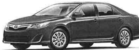
2014 Toyota Camry Wilson Toyota