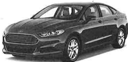
2014 Ford Fusion Ames Ford