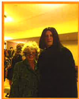
Yule Ball 2012