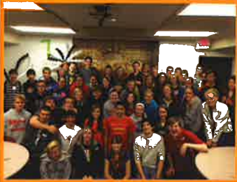
God Save the Queen Life Teen Night Fall 2012