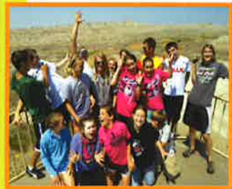
Badlands Trip CHWC 2012