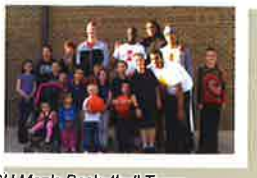
ISU Men's Basketball Team