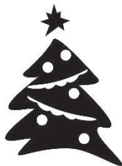
The Giving Tree

Gift tags for the Giving Tree are still available in the Narthex this weekend. Over 500 gifts are needed for various organizations in the community. Please place your wrapped and tagged gift in the collection boxes in the Narthex by NOON on Sunday, December 12 , so the organizations can pick them up in time for their holiday parties.