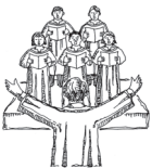
St. Cecilia Choir Practice

Thank you for supporting education at St Cecilia by using SCRIP!