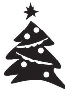
The Giving Tree

Continuing the long tradition of sharing the spirit and hope of the holiday season, the people of St. Cecilia Parish will celebrate with a Giving Tree. Over 500 gifts are needed and will be distributed to the following: The Richmond Center, Lutheran Social Services, Youth & Shelter Services, Mary Greely Behavioral Health, The Abington on Grand, Riverside Manor and St. Cecilia Home Ministry. The gift tags will be available at the Christmas Market on November 20 & 21. Stop by the table in the Social Hall to select one or more gift tags. Collection boxes will be placed in the Narthex the weekend after Thanksgiving. Any remaining gift tags may be picked up in the Narthex Nov. 26/27. Please return your wrapped gift with the tag attached to the collection boxes by Noon on Sunday, Dec. 12, so the organizations can pick them up in time for their holiday parties.