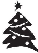
The Giving Tree

Since several receiving organizations have their parties early in December, Giving Tree gift tag distribution and gift collection dead-lines have been moved up. The gift tags will be distributed at the Christmas Market November 20 & 21. Stop by the table in the Social Hall to select one or more gift tags and a list of suggested items. Collection boxes will be placed in the Narthex the weekend after Thanksgiving. Any gift tags not picked up on November 20/21 may be picked up at a table in the Narthex November 27/28. Please bring all gifts to the boxes in the Narthex no later than noon Sunday, December 5.