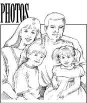
Now being taken for the Church Directory

If you were unable to schedule a time to have your portrait taken for the directory, Busson Photography has agreed to return on December 3 and possibly December 4 (if December 3 appointments fill). Pictures will be taken from 2:30-9:00PM. Sign up sheets will be available in the Narthex after all Masses October 27/28. You may also call the parish office (233-3092) to schedule an appointment. We would like as many individuals/families as possible in the directory so please participate if you can.