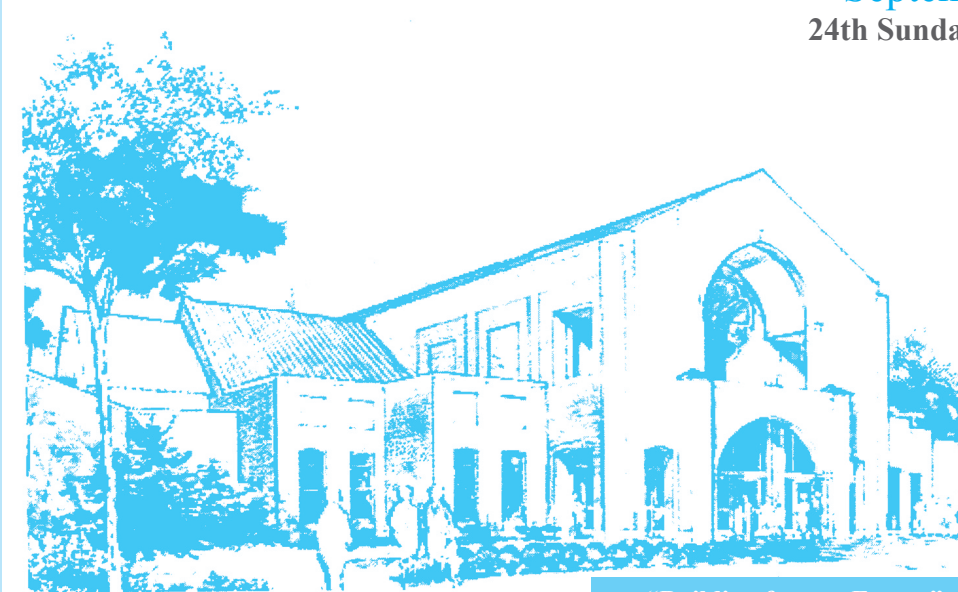
“Building for our Future”

September 16, 2007 24th Sunday in Ordinary time