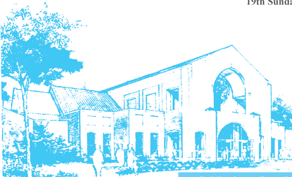
“Building for our Future”

W e are called one by one and as a community to become part of the living presence of Jesus Christ. We are united with the Father and strengthened and enlivened by the Holy Spirit. We are committed daily to love and serve others as Jesus did.