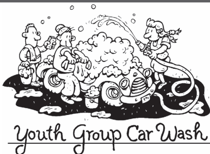
Youth Group Car Wash

Our next preparation session is Thursday, August 2, 6:30-9:00PM in the Adult/Youth Room. All parents seeking baptism for their child are expected to attend a preparation session. To register for the class or schedule a baptism, please call the parish office at 233-3092.