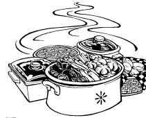
POTLUCK FOR SENIORS