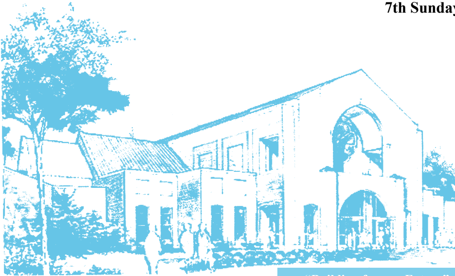
“Building for our Future”

February 18, 2007 7th Sunday in Ordinary Time