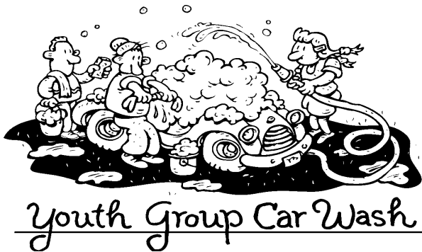
Youth Group Car Wash