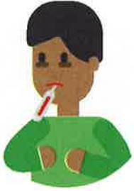
Fever* or feeling feverish/chills

*It is important to note that not everyone with flu will have a fever.