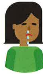
Runny or stuffy nose