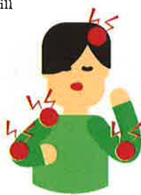
Muscle or body aches